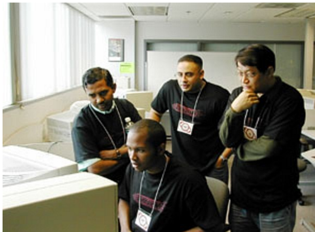
Faculty and students work together on programming assignments.

Select 6 additional upper division Computer Science courses (CS3xx/4xx except CS342)